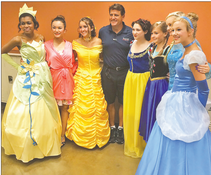
(ABOVE) Members of the Culpeper Robotics team show off high-tech engineering at CulpeperFest June 12. (LEFT) State Sen. Bryce Reeves (R-17) poses with the Disney princesses at CulpeperFest . (BOTTOM) CulpeperFest attendees work out during a fitness demonstration hosted at CulpeperFest.